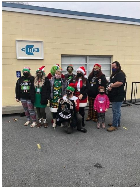
The ILMC Winchester Blue Ridge Mountain Men volunteered their time to come and entertain the crowd on giveaway day!