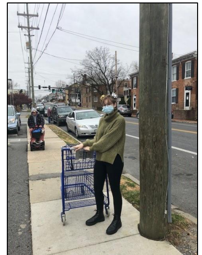
The Handley Interact Club pictured above stationed at the pallets giving turkeys and hams to our community!