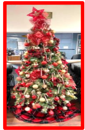
CCAP 2022 Christmas Tree